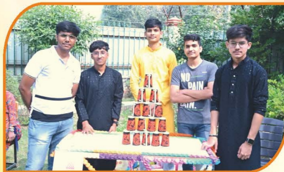
Kasturian Carnival on 08-11-2023