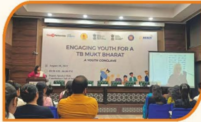
Engaging Youth for a T.B. Mukt Bharat A Conclave on 18-08-23