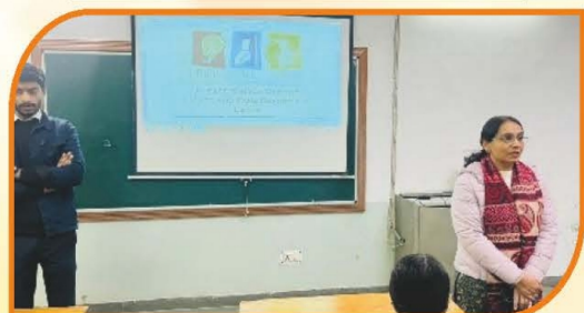
Spark Change-A Step towards Energy Conversation on 27-12-2023