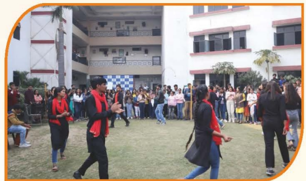
Nukkad Natak 2