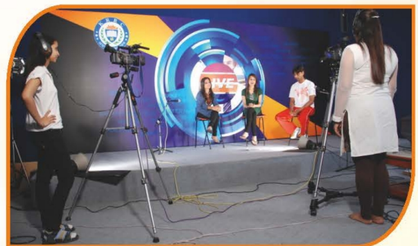
Capturing Moments Society