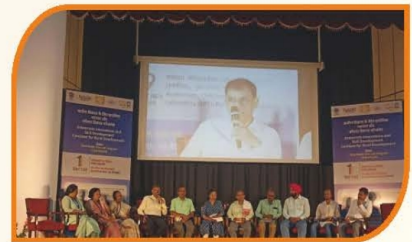
Grassroots Innovations and Skill Development Conclave for Rural Development from 11-09-23 to 16-09-23