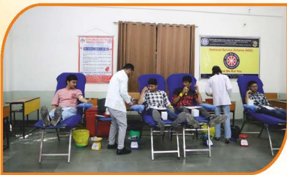
Blood Donation Camp on 18-10-2023