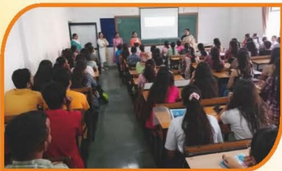
Swadeshi Apnao Khadi Mahotsav on 16-10-2023