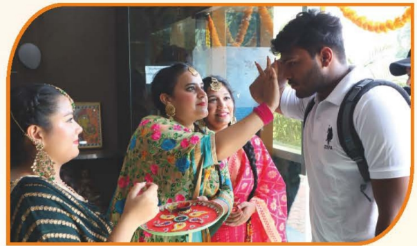
Orientation Day on 19-09-2023