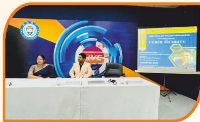
Cyber Security Awareness Campaign on 25-08-23