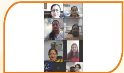
Role of Intestinal Microbiota and Probiotics in Health & Disease Workshop on 21-10-23