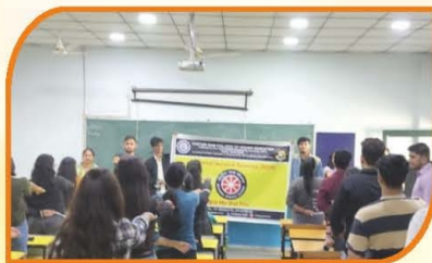
Rashtriya Ektas Diwas Pledge Ceremony on 06-11-2023