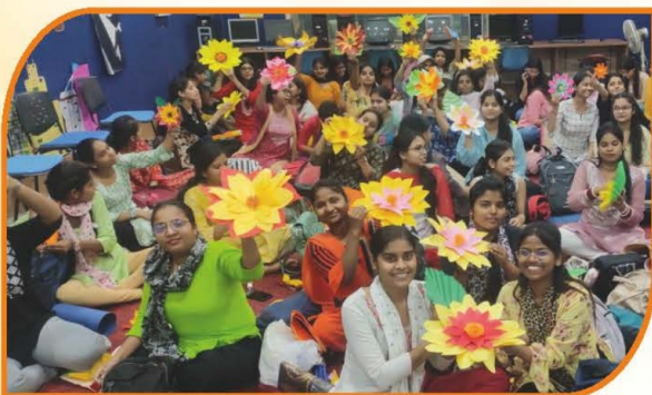
Palette Mixtures Society