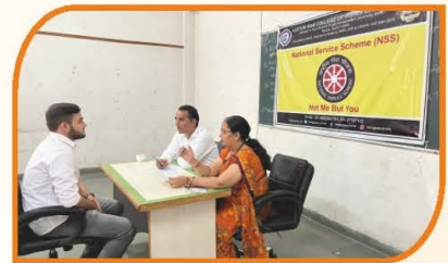
Selection of NSS Team on 08-10-23