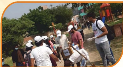
Swachhta Pakhwada Cleanliness Drive on 30-09-23