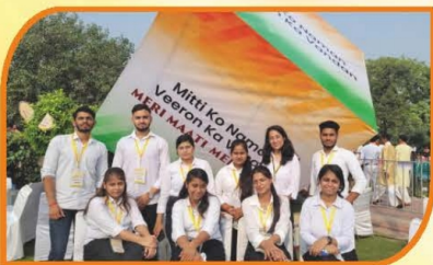
Meri Maati Mera Desh on 31-10-23