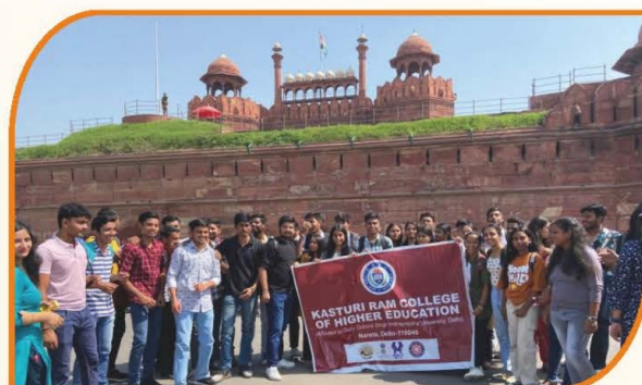
Educational Visit "Red Fort" on 06-10-2023