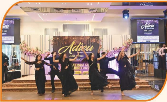
Rhythmic Fusion Society