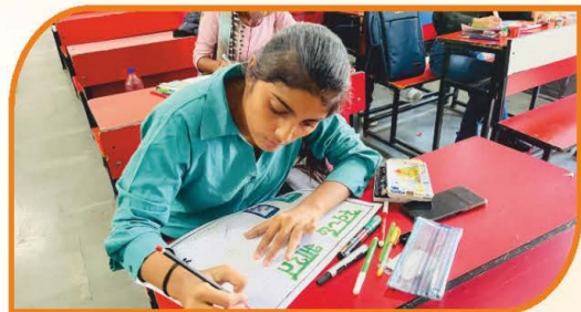
Swachhta Pakhwada from 29-09-2023 to 02-10-2023