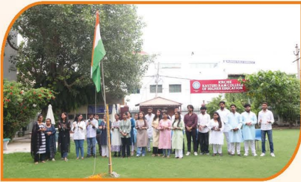
Independence Day Celebration on 14-8-2023