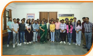
Blood Donation Camp On 18-10-23