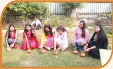
Ghar Ghar Tiranga Veeron Ka Vandan Plantation Drive from 09-08-23 to 16-08-23