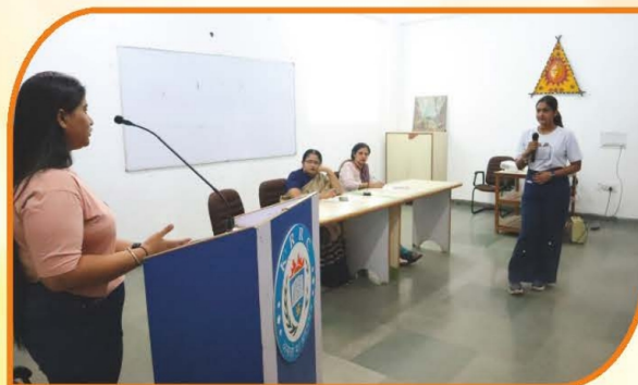
Debate "War Technology" on 13-10-2023