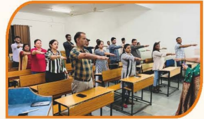
Akshay Urja Diwas on 19-08-23