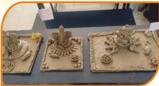
Green Ganesha-Clay Craft Workshop on 19-09-2023