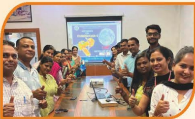
Best Wishes to Chandrayan -3 on 23-08-23