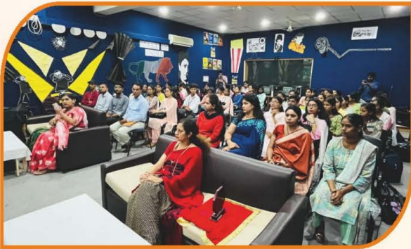
Workshop "Cyber Security Awareness" on 25-08-2023