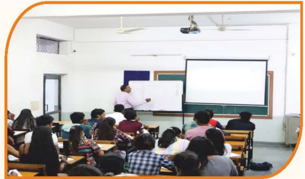
Seminar "How to Build Vocabulary" on 21-09-2023