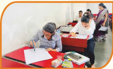
Swachhta Pakhwada on 29-09-23