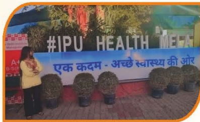
IPU Health Mela from 05-10-2023 to 10-10-2023