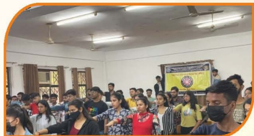
Sankalp Sabha on 03-11-2023